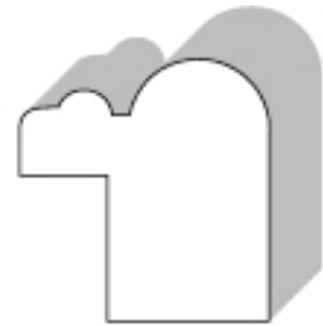
Backband #234 1 1/4" x 1 3/16"

Product #: 234 Product Type: Moulding Category: Window and Door Trim Sub-Category: Backband Dimensions: 1 1/4"x1 3/16"