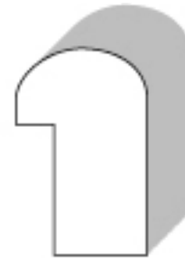
Backband #247 3/4" x 1 3/16"

Product #: 247 Product Type: Moulding Category: Window and Door Trim Sub-Category: Backband Dimensions: 3/4"x1 3/16"