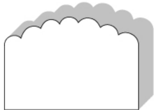
Brick Mould #236 1 9/16" X 2 1/4"

Product #: 236 Product Type: Moulding Category: Miscellaneous Trim Sub-Category: Brick Mould Dimensions: 1 9/16"x2 1/4"