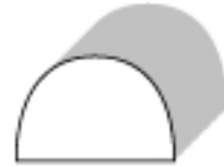
Nosing #303 1/2" X 3/4"

Product #: 303 Product Type: Moulding Category: Miscellaneous Trim Sub-Category: Nosing Dimensions: 1/2"x3/4"