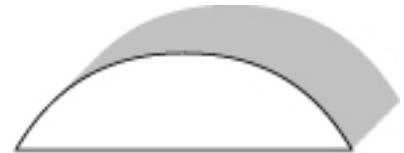
Nosing #304 1/2" X 1 3/4"

Product #: 304 Product Type: Moulding Category: Miscellaneous Trim Sub-Category: Nosing Dimensions: 1/2"x1 3/4"